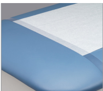
040– Paper Holder