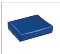
020– Small Pillow