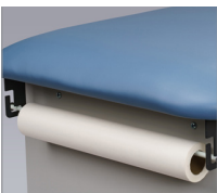
030– Paper Dispenser