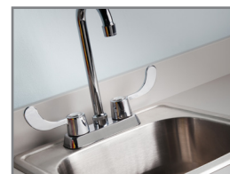
22 Sink & Faucet