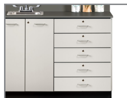
044 Add a Cabinet Drawer