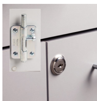
066 Door Lock & Inside Latch Combo