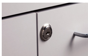
055 Door Lock