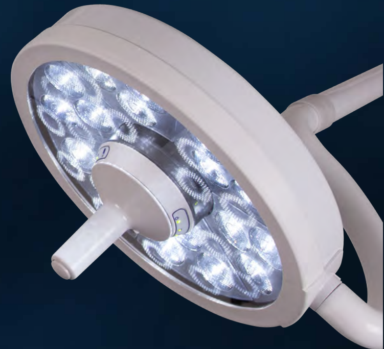
MI-750 Dual Ceiling Mount