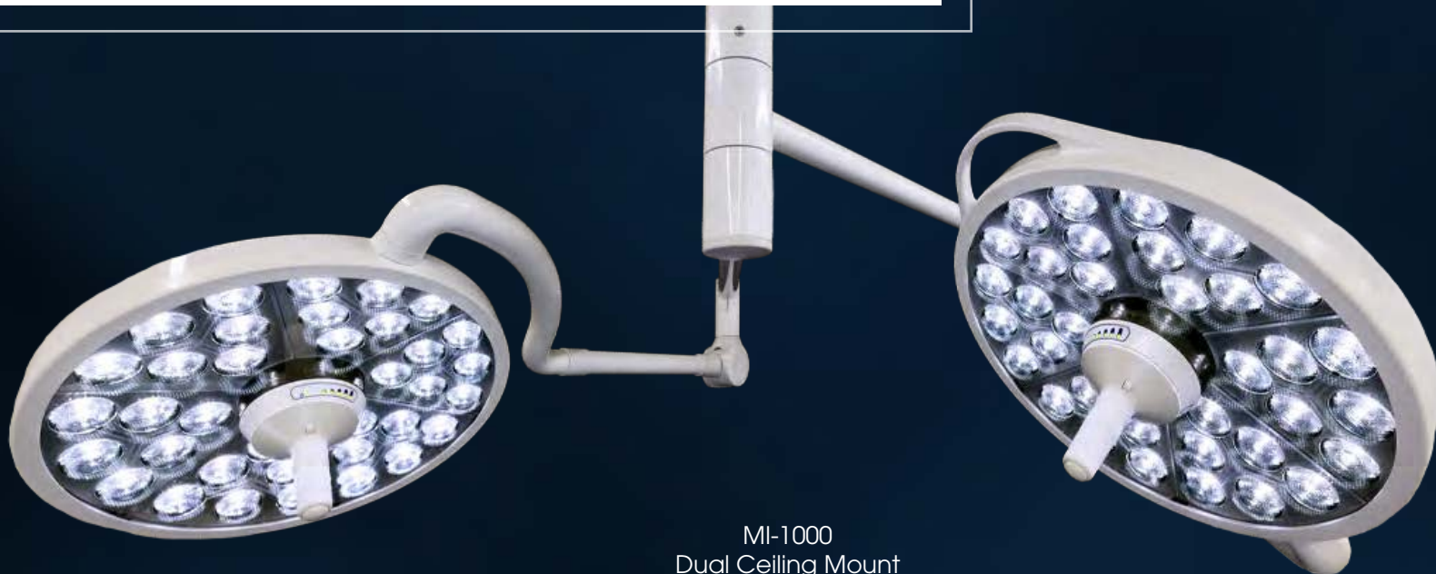
MI-1000 Dual Ceiling Mount