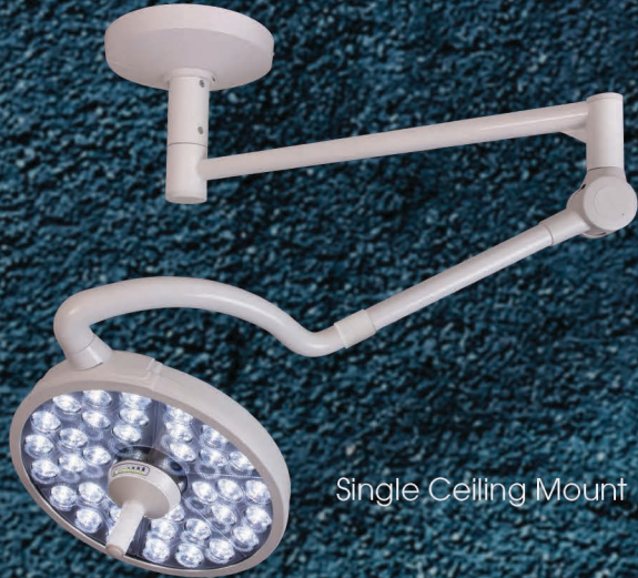
Single Ceiling Mount