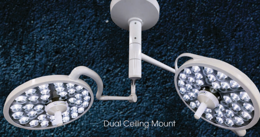
Dual Ceiling Mount