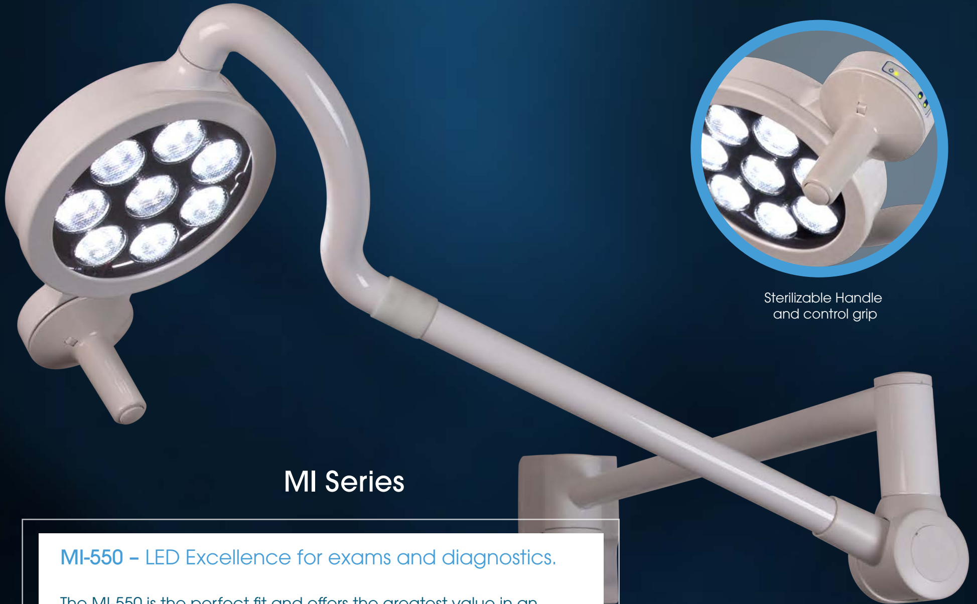
Sterilizable Handle and control grip