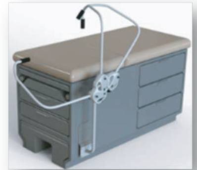
Exam Table/Chair Mount

All models are sold complete with light and flex-arm system. (Product images not to scale.)