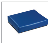
20- small Pillow