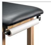
030- Paper Dispenser