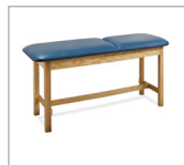
006- Special Length