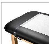
040– Paper Cutter