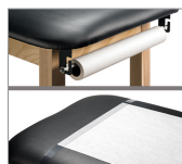
034– Paper Dispenser & Cutter Combo