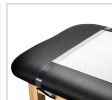
040 Paper Cutter