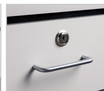
055 Drawer Locks