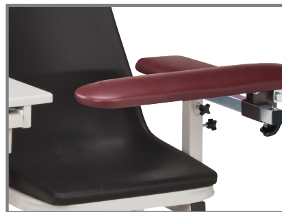
Padded, Armrest and Flip Arm