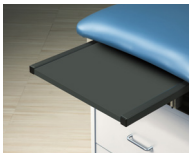
Pull-out, slate, laminate, leg rest