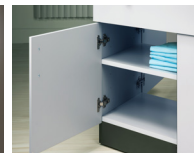
Both Sides Access