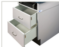
2 drawer storage