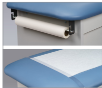
034– Paper Dispenser & Holder Combo