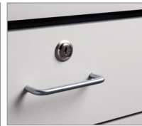
055– Door & Drawer Locks