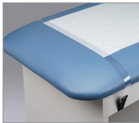
040– Paper Holder