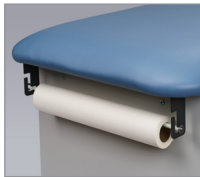
030– Paper Dispenser