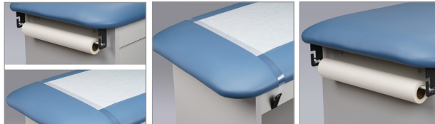
034- Paper Dispenser & Holder Combo