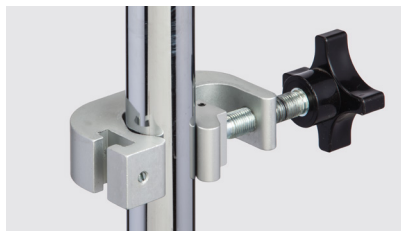
IV-41 Universal Clamp