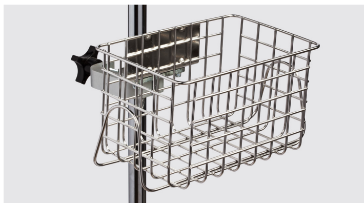
Heavy Duty Stainless Steel Wire Basket