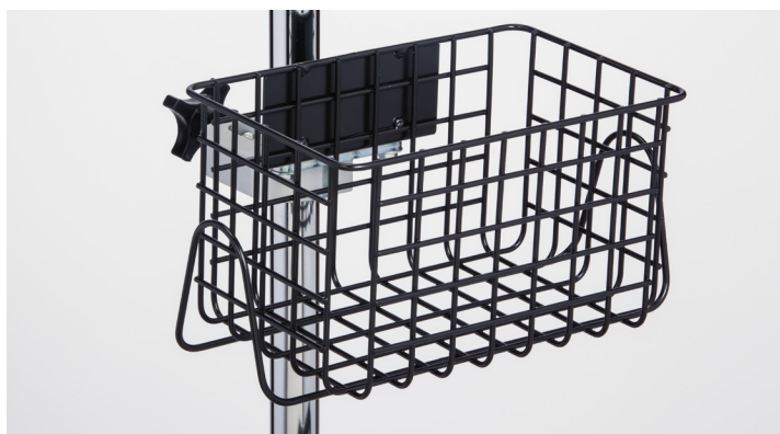
Heavy Duty Black Epoxy Wire Basket