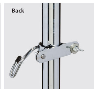
IV-56 Drainage Hook