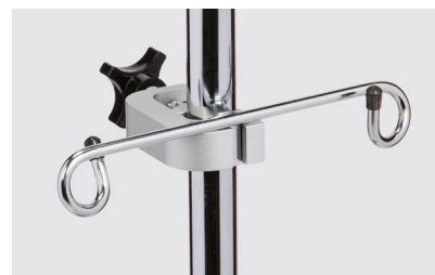
IV-57 Single Ram's Horn