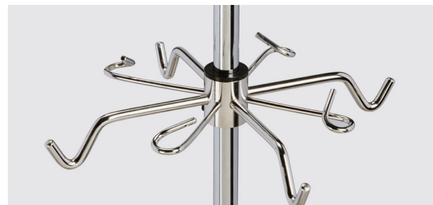
IV-55 Extra Hooks and Organizer Hooks