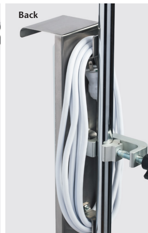
IV-50 Pole Outlet Strip