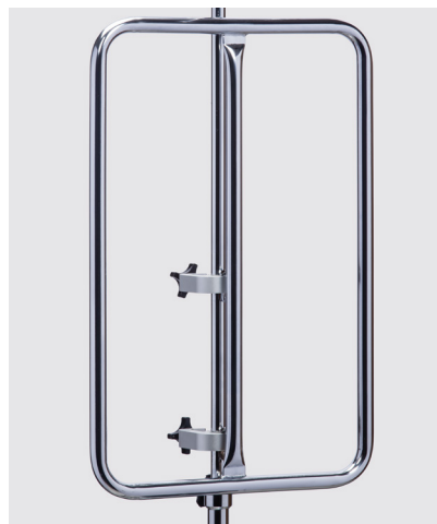
IV-42 Infusion Pump Frame