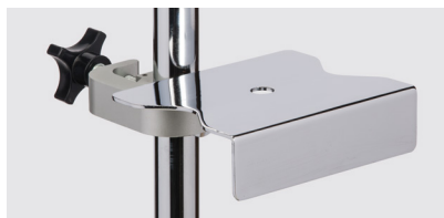
IV-46 Pump Tray Support