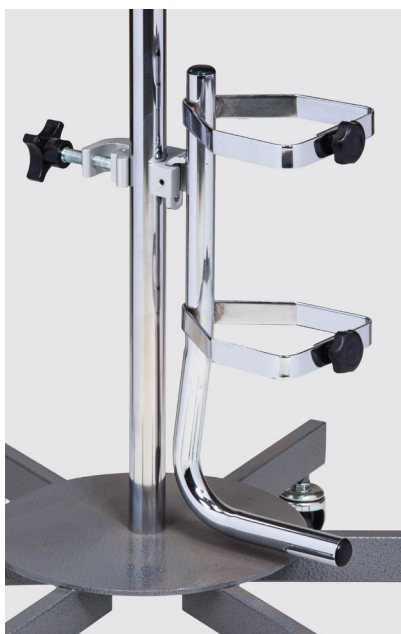
IV-44 Oxygen Cylinder Holder