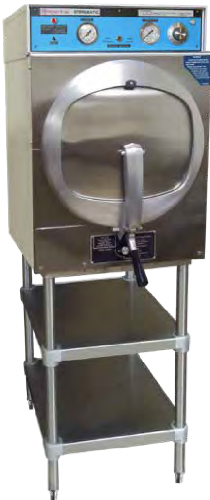
Shown on optional stand 95-6060