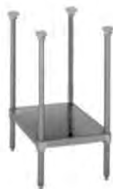
95-6060 S/S Stand