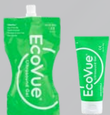
Ultrasound Gel 8.8oz | 2.1oz (GEL-110) (GEL-100)