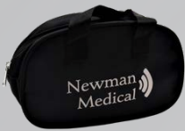
Carry Bag (ACC-170)