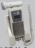
Wall/Table Base (ACC-121)