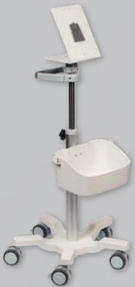
Roll Stand (STND-121)