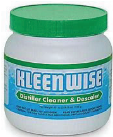
Kleenwise™ Distiller Cleaner and Descaler PN# KSD